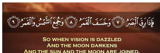
Figure 4. Surah Al-Qiyamah verse (7 to 9)

It is also stated in Surah Al-Qiyamah verse (7 to 8) that the moon will be without light and the sun and the moon will gather: