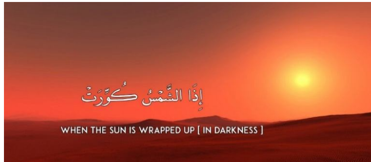
Figure 2. The first verse of Surah al-Takwir

That is, when the sun becomes entangled. It means the passing of sunlight and its setting. According to the Qur'an, at the end of the world, the brightest source of light in our solar system, which is the source of light for all the planets, will shut down and gather, and other stars will also suffer the same fate. Who have considered this verse one of the scientific miracles of the Qur'an. The Qur'an's interpretation of the darkening of the sun and the dimming of the stars, one of which is the sun, is completely correct. Today's scientists believe that the energy of the sun that spreads in space is obtained from nuclear combustion, whose fuel is hydrogen and its ash is helium. For this reason, every day and night, three hundred and fifty thousand million tons of this sphere's weight is reduced, causing it to gradually become thin and dim [ https://quran.com/ ]. The existing system of the planets also collapses, as if the balance of attraction and repulsion related to their "mass" and "speed of movement" is disturbed, and perhaps this is what is stated in the Holy Quran. It means that at that time the stars will scatter and collapse (Anfatar-2).