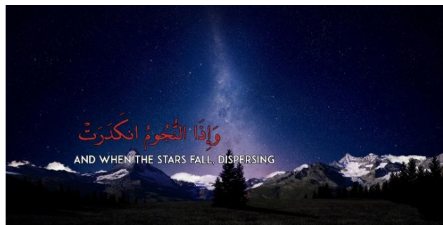
Figure 3. The first verse of Surah al-Takwir

That is, when the sun becomes entangled. It means the passing of sunlight and its setting. According to the Qur'an, at the end of the world, the brightest source of light in our solar system, which is the source of light for all the planets, will shut down and gather, and other stars will also suffer the same fate. Who have considered this verse one of the scientific miracles of the Qur'an. The Qur'an's interpretation of the darkening of the sun and the dimming of the stars, one of which is the sun, is completely correct. Today's scientists believe that the energy of the sun that spreads in space is obtained from nuclear combustion, whose fuel is hydrogen and its ash is helium. For this reason, every day and night, three hundred and fifty thousand million tons of this sphere's weight is reduced, causing it to gradually become thin and dim [ https://quran.com/ ]. The existing system of the planets also collapses, as if the balance of attraction and repulsion related to their "mass" and "speed of movement" is disturbed, and perhaps this is what is stated in the Holy Quran. It means that at that time the stars will scatter and collapse (Anfatar-2).